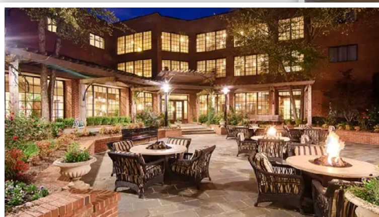
Doubletree Suites Charlotte Southpark, NC